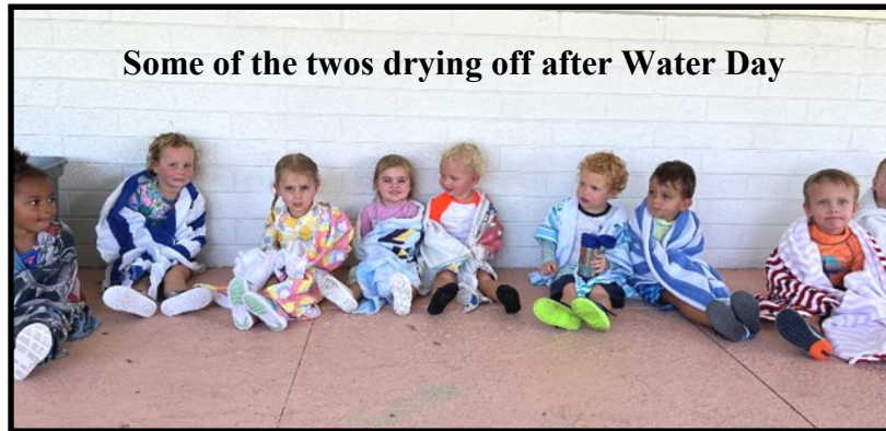
Some of the twos drying off after Water Day