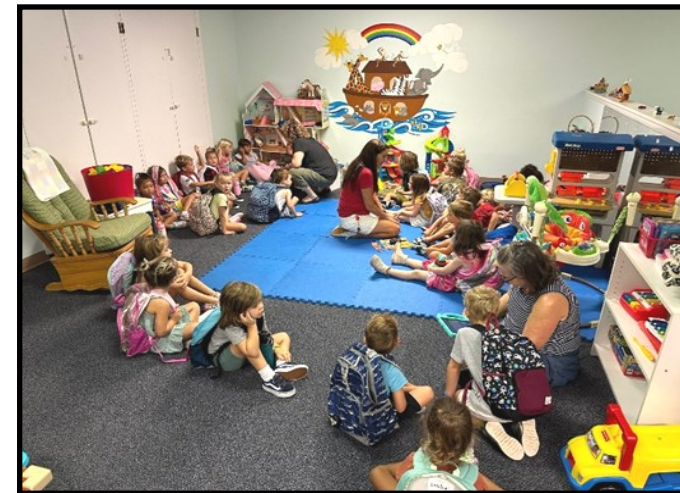
VPK Classes in the safe room (Nursery) during a Severe Weather Drill.