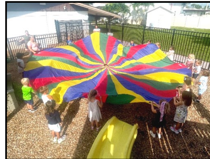
All the VPK students playing with the parachute at playground time.