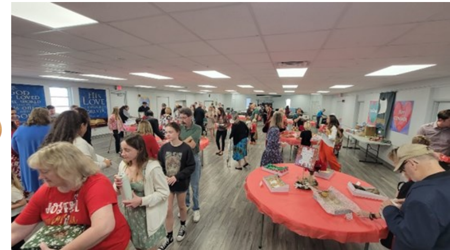
Cookie Walk 2024