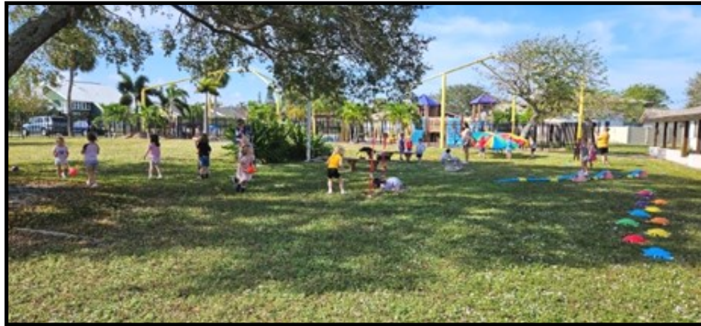
Field Day during our make up day for the Hurricane