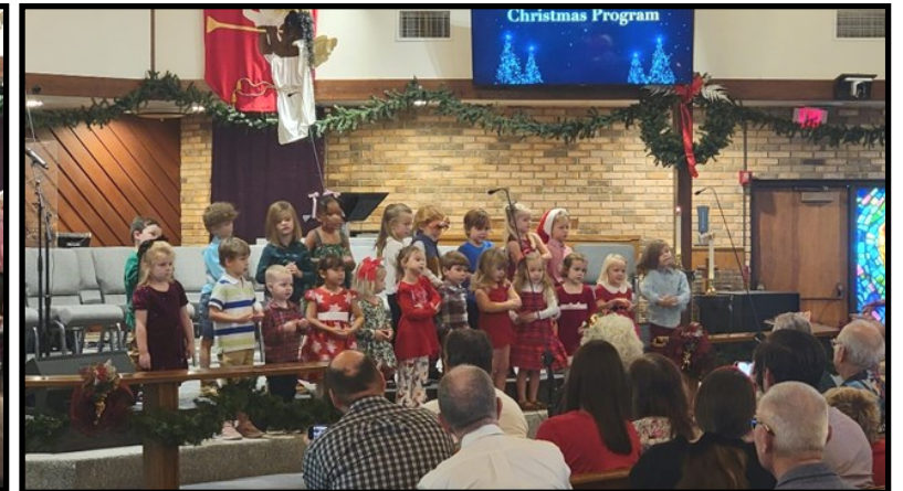
Sunday Morning singing