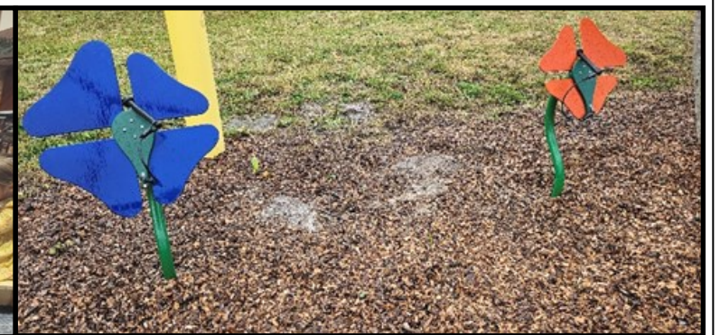
Musical instruments that were purchased with the proceeds from the last two Cookie Walks.