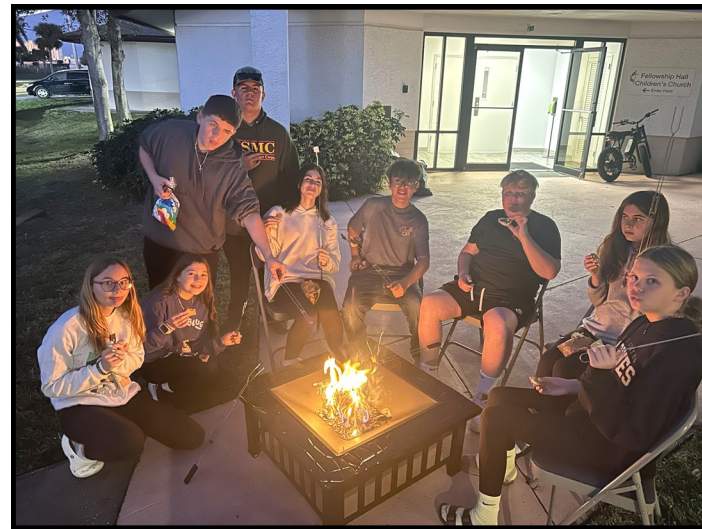
Several of the youth group students enjoying s'mores around the fire pit.